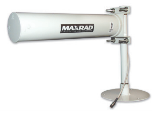
For the 16755 Yagi antenna, the primary and secondary elements are enclosed in a white cylinder.