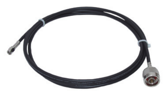
The purchase of an antenna cable (COAXRPSMA-L shown) is required for our outdoor antennas.

When using the CM230, fix the declination of the antenna by tightening the u-bolt that mounts on the mast. The inclination is then adjusted with the other set of ubolts and nuts.