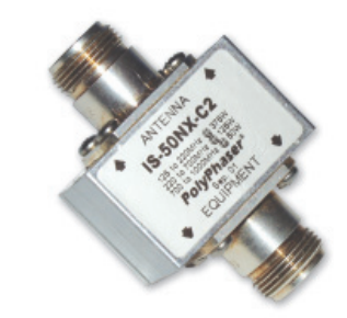
The surge protectors help protect the radios from electrical transients conducted through the antenna cable.